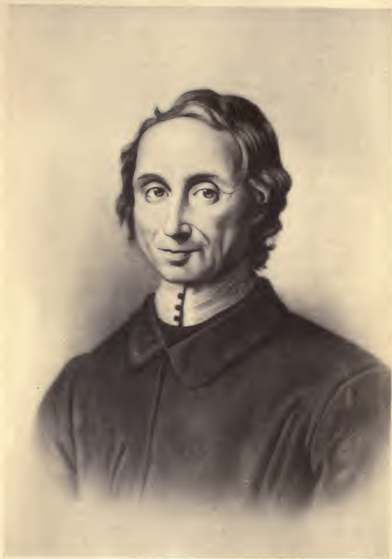
NICOLAS DE MALEBRANCHE.